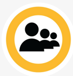
Norton Family Premier